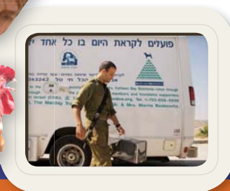
■ CHAI was there, educating children.